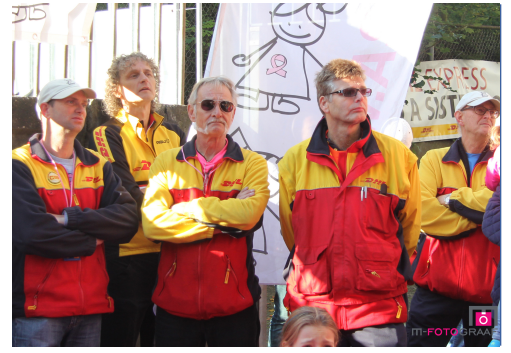
million euro being delivered to breast cancer research labs at university medical centers across The Netherlands. It was walker

Since 2007, A Sister's Hope has had the bold yellow and red presence of DHL Express on events. The volunteer team, the trucks, the logistics assistance, the last-minute aid for unexpected needs ... DHL has been an invaluable and wonderful corporate partner for A Sister's Hope and has been a key factor in the success of 4.66